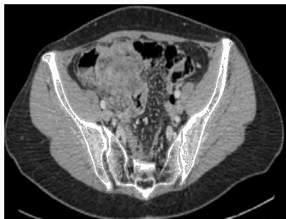
Figure 1: Bulky cancer of the ascending colon with enlarged regional necrotic lymph nodes.

The surgeon stood on the patient’s left, the camera operator on the left of the surgeon and the assistant on the patient’s right. The operative port position consisted of four sites: a 10 mm camera port, placed about 2 below the umbilicus on the midline; a 10 mm operative port, placed at the intersection of the left mid-clavicular line and the midpoint perpendicular to the diploid umbilical line; two 5 mm assistant operating ports, placed at the intersection of the left mid-clavicular line and the anterior superior iliac spines line and about 3 cm below the costal margin on the right mid-clavicular line (Figure 2).