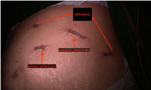
Figure 2: Port position.