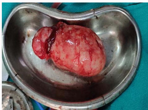
Figure 2: Showing distended gallbladder with focal thickening at fundus.